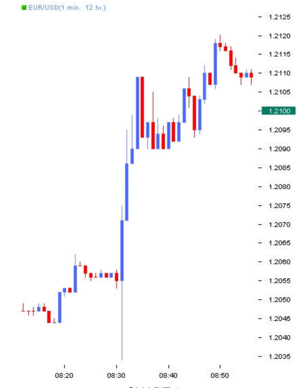
CHART 2 EUR/USD June 15, 2004 – 1 minute candles (time is EST)