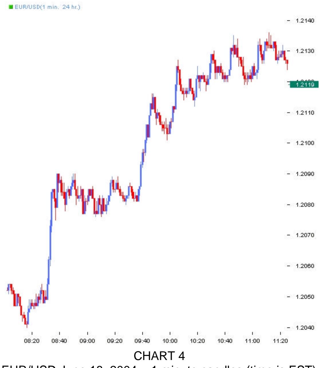
EUR/USD June 18, 2004 - 1 minute candles (time is EST)