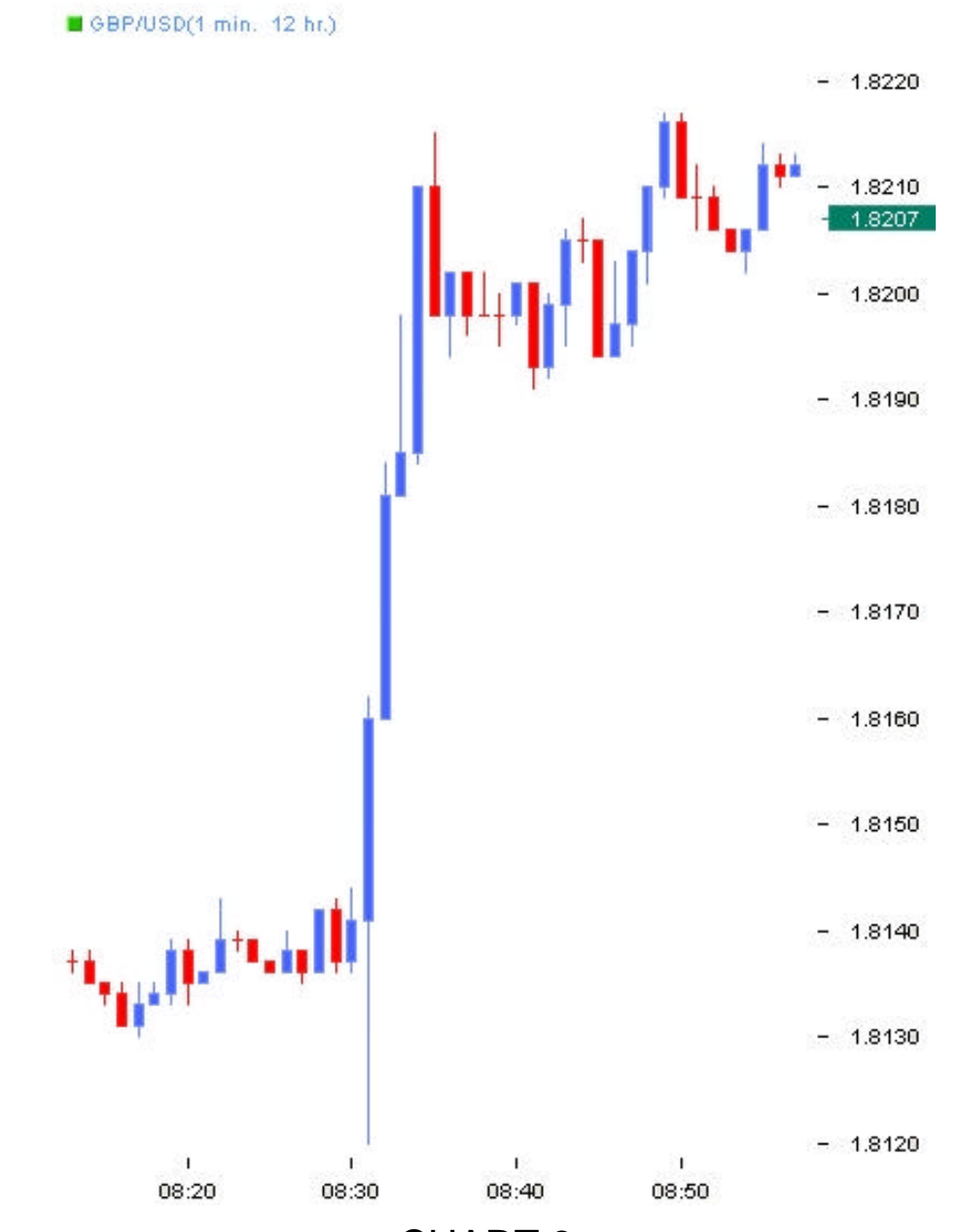
CHART 3 GBP/USD June 15, 2004 – 1 minute candles (time is EST)