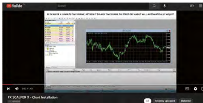
Chart Installation: https://youtu.be/quHreRl6vIw

(Must install the EA on every pair that you're going to use (time frame doesn't matter))