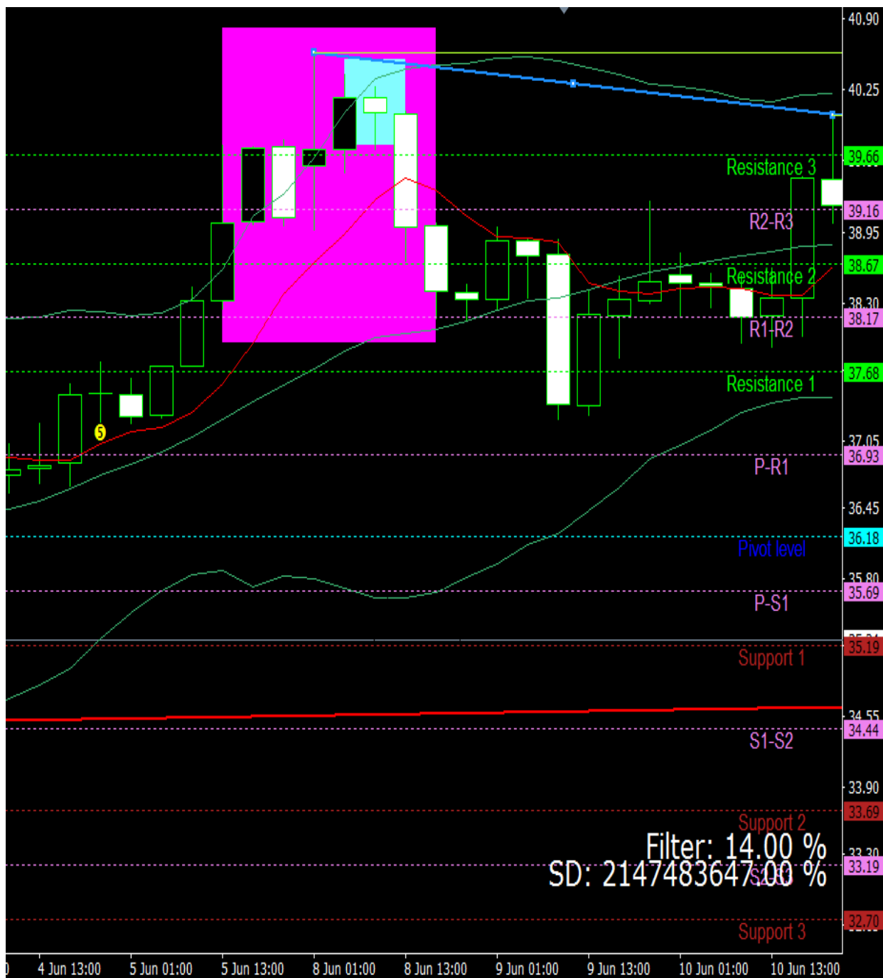
PIC 2 : Alert samples

Assume that line 'Resistance 3' is 1 of 8 lines drawn by the indicator Refer to pink box