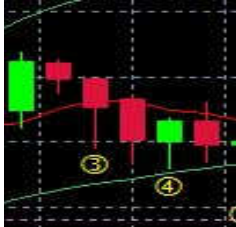
Pattern # 6

Candle 3 appear first followed by a random candle followed by candle 4